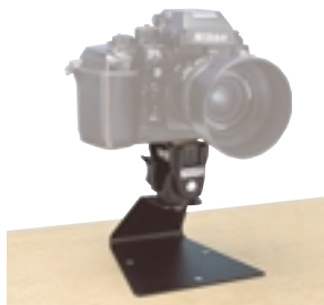
TABLE SUPPORT 355

Made of sturdy aluminium, this 25 x 35cm platform can support up to 20kg. It is ideal as a projector or monitor stand.