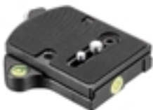
PLATE ADAPTOR 394

Supplied with 1/4" and 3/8" camera fixing screws. Fixing 1/4" and 3/8" thread. 384PL and 384PLARCH plates included.