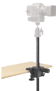
TABLE CENTER POST 131TC

Geared column with clamp for table thickness from 18-38mm, for supporting a camera adjustable between 5cm and 66cm. Head not included.