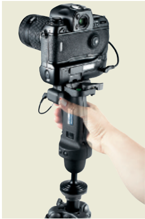
322RS fitted for right-handed use of the 322RC2 head in vertical position.