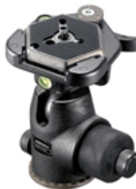
HYDROSTATIC BALL HEAD WITH RC0 RAPID CONNECT SYSTEM 468MGR0