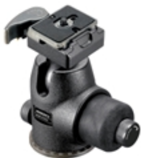
HYDROSTATIC BALL HEAD WITH RC2 RAPID CONNECT SYSTEM 468MGR2