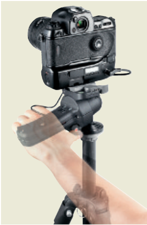
322RS fitted for left-handed use of the 322RC2 head in horizontal position.