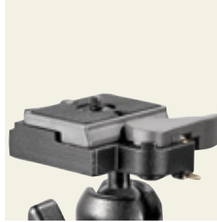
On models 484RC2, 486RC2, 488RC2, 468RC2 : rectangular quick release plate.