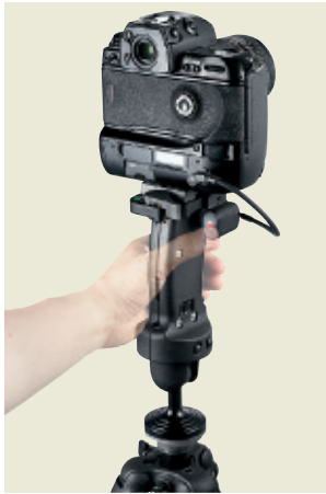
322RS fitted for left-handed use of the 322RC2 head in vertical position.