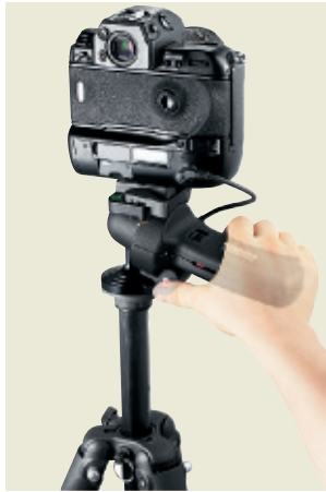
322RS fitted for right-handed use of the 322RC2 head in horizontal position.