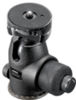
HYDROSTATIC BALL HEAD 468MG

Manfrotto's range of quick release plates is as broad as the range of photographic shooting equipment available in the world. One of the principle criteria used in manufacturing a quick release camera plate is its capability to hold the weight of the camera in all head positions. That is why, for example, the 200PL (RC2) connect plate system is mainly used to hold SLR systems, while the 410PL (RC4) is used with medium format cameras, and the sliding quick release system, 357PL/501PL (RC3/RC5), is used with cameras with heavy and bulky tele lenses. In order to give all professionals the possibility to work with this innovative ball head, we have prepared a version for every quick release camera plate Manfrotto manufactures plus a fixed version for those who prefer this type of attachment. Enjoy the choices!