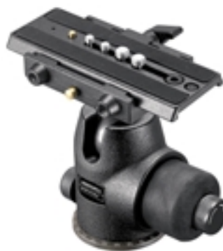
HYDROSTATIC BALL HEAD WITH RC3 RAPID CONNECT SYSTEM 468MGR3