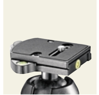
On models 484RC4, 490RC4, 468RC4 : large rectangular quick release plate.