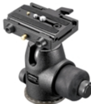
HYDROSTATIC BALL HEAD WITH RC5 RAPID CONNECT SYSTEM 468MGR5