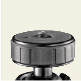
On models 482, 484, 486, 488, 490, 468 : fixed screw.

Our new centre ball series is hot out of the hands of the design team. Favoured by those who give priority to speed over millimetric precision when setting up the perfect shot, the range offers considerable weight-saving features and low-profile design. Made completely of aluminium, the Manfrotto centre ball head range offers each type of user a similar basis to build upon. Movements across models have been brought closer together, while positioning angles cover 360° rotation around the vertical axis to +90° / -90° lateral tilt. The ratchet lever ball lock system is secure and fast, with speed in use further guaranteed by the quick release plate optional on many of the models in the series in addition to the standard 1/4" or 3/8" fixed screw.