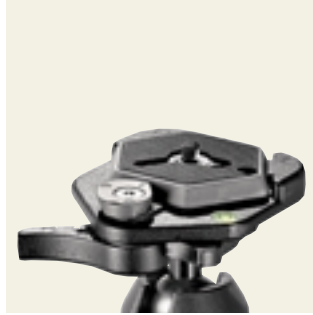
On model 488RCO : hexagonal quick release plate