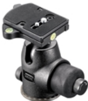
HYDROSTATIC BALL HEAD WITH RC4 RAPID CONNECT SYSTEM 468MGR4